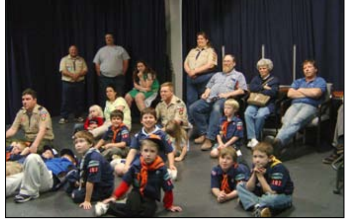
These scouts from Pack 107 are on a Media Literacy Visit at CCTV to earn their communication badges.