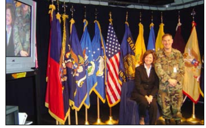
CCTV has had a long friendship with the Oregon National Guard and has helped create several public service messages celebrating the Guard's work.