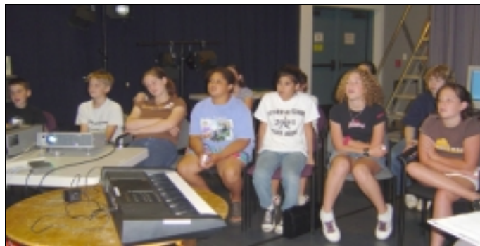
BELOW: Summer Media Camp students learn about CCTV's studio.

CCTV held two one week summer camps for students to learn about television production. The first camp produced a program about the Salem Public Library , and the second camp had a video contest between the boys group and the girls group which was judged by staff.