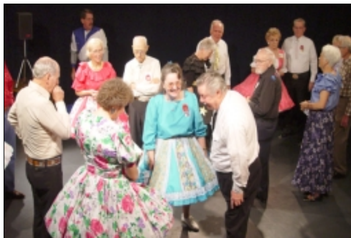
Above: The Swinging Stars Square Dance Club make a public service message in the CCTV studio.