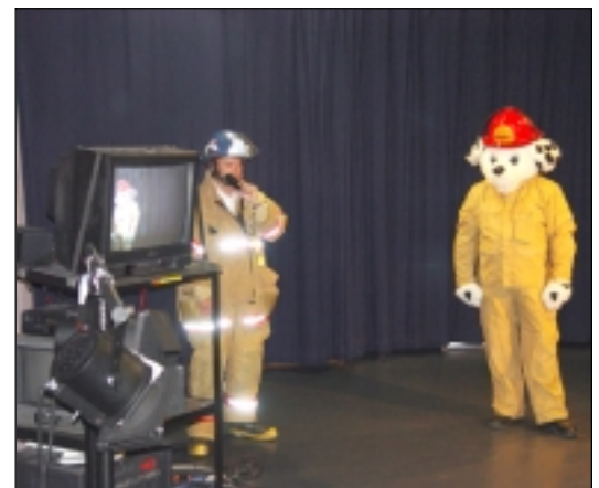
ABOVE: Salem Fire Department personnel tape a public service message in the CCTV studio.

By special request, the University of Oregon asked CCTV to produce the Festival of Bands competition in Eugene.